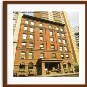
RESIDENCE I 125 E. 24TH ST. NEW YORK, N.Y. 10010

Services to the tenants include: money management, medication management, advocacy, medical and psychiatric treatment, securing benefits and providing, when available, suitable clothing for the season. Through staff interaction with the tenants, the program seeks to develop and enhance the dignity, skills and appropriate behavior of the tenants, facilitating their integration and acceptance into the community.