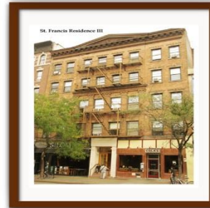
RESIDENCE III 148 EIGHTH AVE. NEW YORK, N.Y. 10011

MAIN CONTACT 212-206-1466 www.stfrancisfriends.org