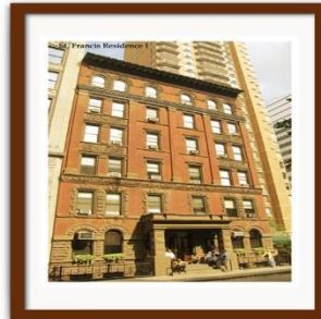
RESIDENCE I 125 E. 24TH ST. NEW YORK, N.Y. 10010

Through staff interaction with the tenants, the program seeks to develop and enhance the dignity, skills and appropriate behavior of the tenants, facilitating their integration and acceptance into the community.